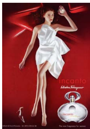
Fig. 1 Incanto

Women's reification is a burning issue which appears not only in everyday life, but also in literature, film and advertising. This study should be placed in a cultural context, as it deals with the condition of being a woman – i.e. white, Western, not married, and (must needs) mother-to-be. Men have always seemed to be fascinated with the female body and have developed certain stereotypes about it as well as about the roles a woman should have. As I hope this study has demonstrated, women are presented as temptresses, possessing the perfect body which they use as a weapon to seduce men. The occasions on which women rebel against this patriarchal idea of the female body occur seldom because they are seen as a challenge to or even an undermining of, the patriarchal order of the world.