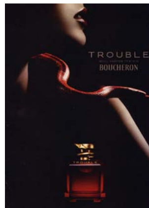
Fig. 2 Trouble